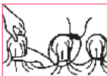
5 Making Cones