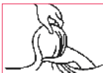
6 One central knot

Cotton Polyester: Smells like burnt paper, forming a hard ball and darkened at the tip.